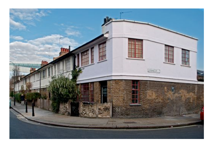
Nos 37-53 Sterne Street, W12, designed by George Walton in 1922. The architect himself lived and worked at No. 53 in the foreground. The whole terrace is listed Grade II.

In 1922 Walton built more houses in Sterne Street for Kingerlee and Sons, Oxford builders with whom he had worked since 1905. Although the site was restricted, he managed to fit in two cottages set back from the road (Nos 33 and 35) and a terrace (Nos 37–53), all in brick with rendered upper storeys and low-pitched slate roofs. The most notable feature is the fenestration of the upper floor, which results in each house having five windows. The shaping of the windows in the front doors nicely illustrates Walton's careful attention to small details. The overall effect of these houses is a subdued Art Deco. Walton himself lived at No 53, where he worked in a studio in the garden accessed by a side entrance. The interior design of No 53 included a rather grand hall, which made the place seem larger and lighter than it was.