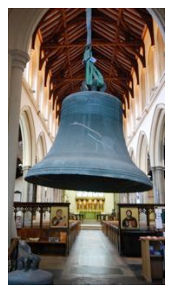
The 'Churchwarden' tenor, one of All Saints Fulham's peal of 10 bells and one of the original six bells made in 1549 and recast and rehung in 1729.

As most readers will be aware, All Saints Fulham, has a magnificent peal of 10 bells. The biggest six bells, of which the tenor is biggest of all, date from 1549. They were recast and hung with two new trebles in 1729. In 1759 another two trebles were added, making a peal of ten. In time the original oak bell-frame dried out, resulting in movement making the bells difficult to ring. This movement also damaged the tower, hence the recent work to restore and strengthen it. While the work was being carried out, All Saints took the opportunity to have the bells refurbished at the Whitechapel Bell