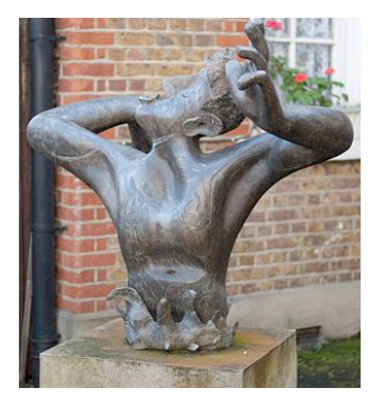
Leon Underwood's Phoenix for Europe sculpture, given to the borough in the 1970s and now in the Macbeth Centre.

One of the artists featured in last year's Brook Green Artists exhibition at Hammersmith Library was Leon Underwood ( see Newsletter 29, page 3 ). Underwood (1890-1975) lived close to Brook Green at 12 Girdlers