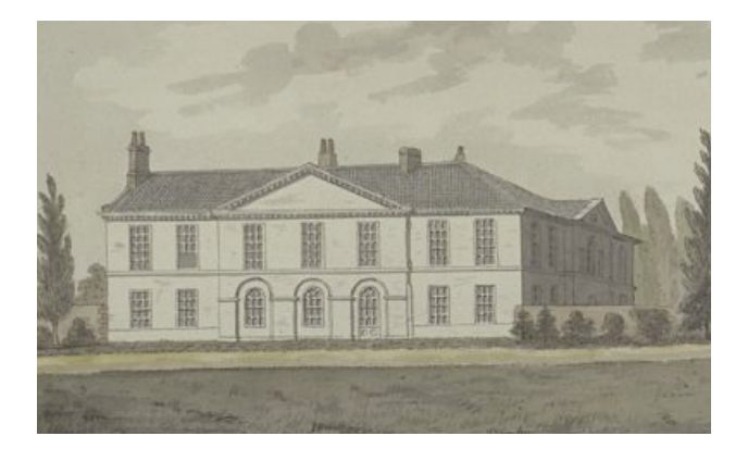
The first Peterborough House, a 17th-century mansion on the south side of Parsons Green, where Peterborough Road is today.