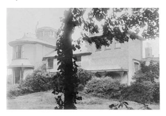
A rare view of Wood House north of Shepherd's Bush Green. Its site is now covered by Westfield and White City tube.

One of the borough's lost mansions, Wood House used to stand on the east side of Wood Lane to the north of Shepherds Bush Green.