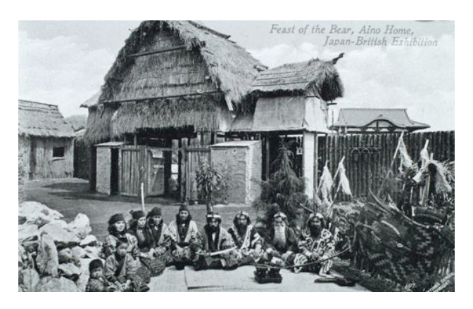
One of the native villages created for the Japan-British exhibition held on the White City exhibition ground 100 years ago this year.

In the Garden of Peace, maple and cherry trees have been planted, the pond rehabilitated and enlarged and a play area created for children, with rocks surrounded by a gravel garden representing the story of the Crane and the Turtle (both symbolising long life) and their journey to the place of eternal happiness. The Forest Garden contains trees and mounds representing Japan's ancient mountains such as Mount Fuji.