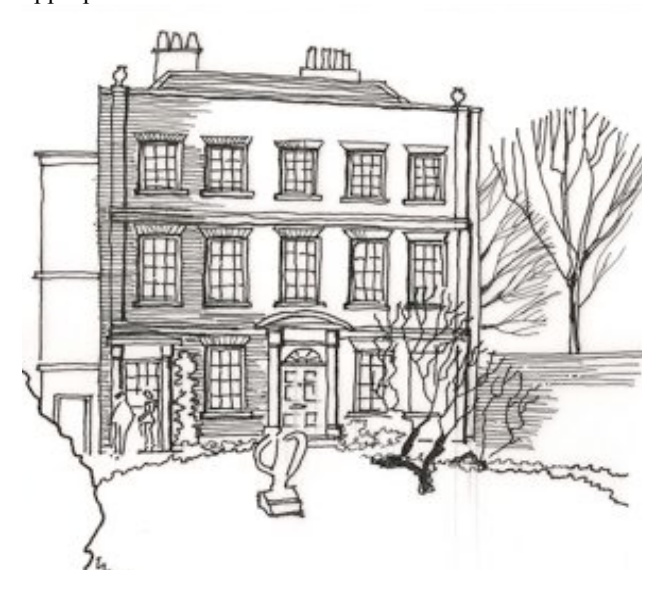
Sussex House, the Grade II* house of c1726 on Hammersmith Upper Mall whose setting is threatened by the Hammersmith town hall redevelopment scheme and associated plans (see above, p. 1).

Published at almost the same time as the new PPS5 and the related Practice Guide was the government's Statement on the Historic Environment for England (2010), which embodies the vision 'that the value of the historic environment is recognised by all who have the power to shape it; that government gives it proper recognition, and that it is managed intelligently and in a way that fully realises its contribution to the economic, social and cultural life of the nation'. So this document is a statement of intent, arguing and illustrating the thesis that the historic environment does indeed have values (in diverse ways) that warrant its proper care, conservation and understanding. PPS5 refers to the government's Statement, and points out that 'planning has a central role to play in conserving our heritage assets and utilising the historic environment in creating sustainable places'. The historic environment policies in PPS5 are seen as enabling 'the government's vision for the historic environment as set out in the 2010 Statement to be implemented through the planning system, where appropriate'.