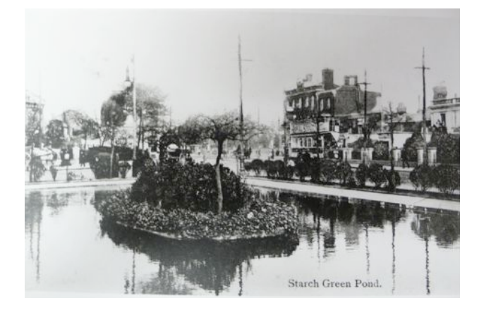
Starch Green may not get its pond back (as shown here in this 1906 view), but we are hopeful that the historic junction of Askew Road and Goldhawk Road can one day be 'green' again.

Sale of Listed Buildings The council has announced its intention to dispose of further listed buildings it owns. Previously the ex-St Paul's high master's house in Hammersmith Road, the Castle Club and Wormholt Library had been put up for sale. The Group is concerned