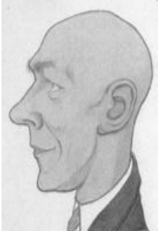
Self-caricature by Legat, 1924

Having lived through the revolutions and upheaval of the first two decades of the 20th century in Russia, Legat finally severed his ties with the Mariinsky Theatre and the Imperial School in 1923. He spent some time in Europe and was ballet master for Diaghilev's Ballets