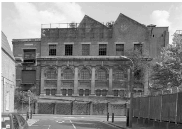
A fairly recent photograph showing the Townmead Road elevation of the derelict factory building on Fulham Wharf which Sainsburys have bought and plan to re-develop.

Sainsbury's have bought Fulham Wharf in Townmead Road and have plans to build a brand new store on the site to replace their existing one, with new housing as part of the development.