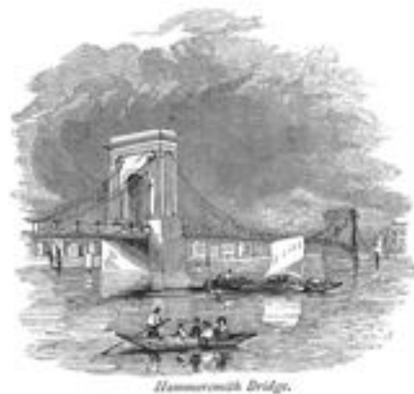
The first Hammersmith Bridge, designed in the 1820s by William Tierney Clark, chief engineer to the West Middlesex Waterworks, whose pumping station was nearby. The bridge survived until the 1880s when it was rebuilt by Sir Joseph Bazalgette (see below, page 11).