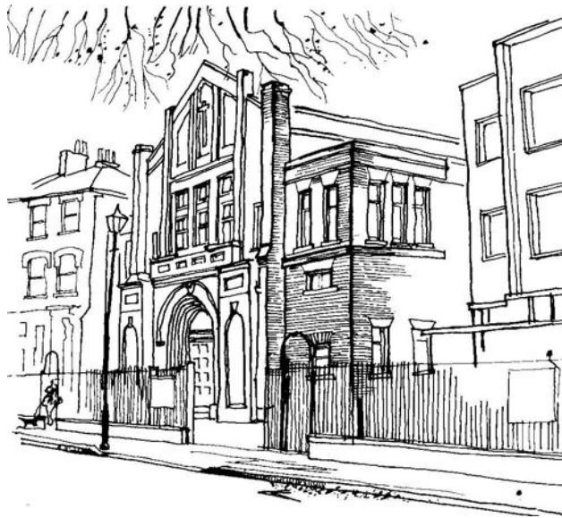
The former Hammersmith & West Kensington synagogue in Brook Green, opened in 1890 and closed in 2002. It is now used by the Chinese church in London.

It is not known when Jews first settled in Hammersmith and Fulham, but by the late 19th century they were numerous enough to support a synagogue. Subsequently, two other Jewish synagogues were established in the borough. There is no longer a Jewish community in Hammersmith & Fulham large enough to support a synagogue, but the borough's three former synagogues survive and are used for worship by other branches of the Abrahamic religions.