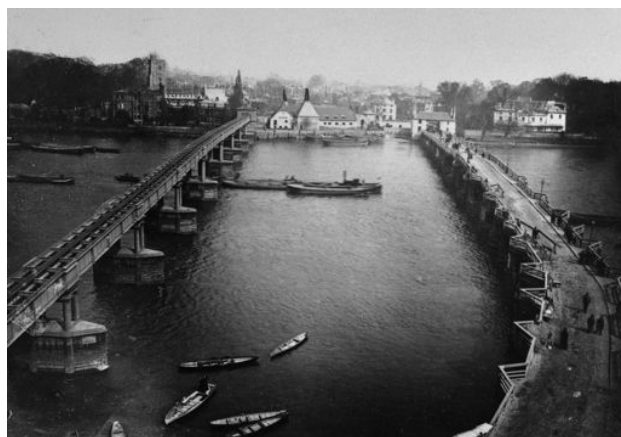
View from Putney of old Fulham Bridge (on right), showing the old toll house straddling the bridge at the Fulham end.

The Thames Discovery Programme working near Putney Bridge has found stakes in the river thought to be part of a fish trap and dating to the Iron Age. The footings of old Fulham Bridge have also been revealed.