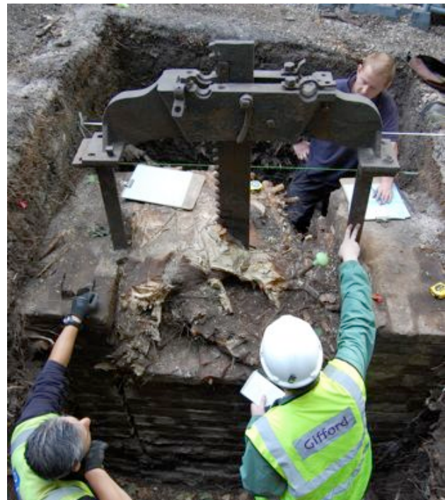
Recent excavations at Fulham Palace revealed the winding gear of the old moat sluice gate.

It is proposed to dig out the moat either side of the palace entrance in Bishops Avenue to demonstrate that there used to be a moat surrounding the palace grounds and also to reveal the bridge across the moat. Most people have been unaware of this since the moat was in-filled during the 1920s. The moat would be dry, but long-term, flooding this short stretch of moat is a possibility. Test bores were drilled to ascertain the moat's depth and the make-up of the fill, particularly any contaminants. To remove the fill and dump it in an approved site is costly. The winding gear of the sluice gate is still visible in the riverside section of the moat. This was in use until the early 20th century. Dirty water could be released into the Thames and clean Thames water used to refill. However, with the failing of the sluice and the Thames becoming increasingly dirty, the moat became a stagnant ditch. The cost of cleaning was expensive. The sluice appears to have been first built in 1618 and rebuilt in 1842.