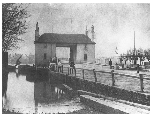
The large toll-house straddling old Fulham Bridge at the Fulham end of the bridge, next to the former drawdock. Recent excavations in the dock have revealed part of the abutment wall of the toll-house.

After a public outreach day at Fulham Palace in July, two of us had taken a brief look at the old Swan drawdock, situated between Willow Bank and Carrara Wharf, at the junction of Ranelagh Gardens and Fulham High Street, just to the east of Putney Bridge.