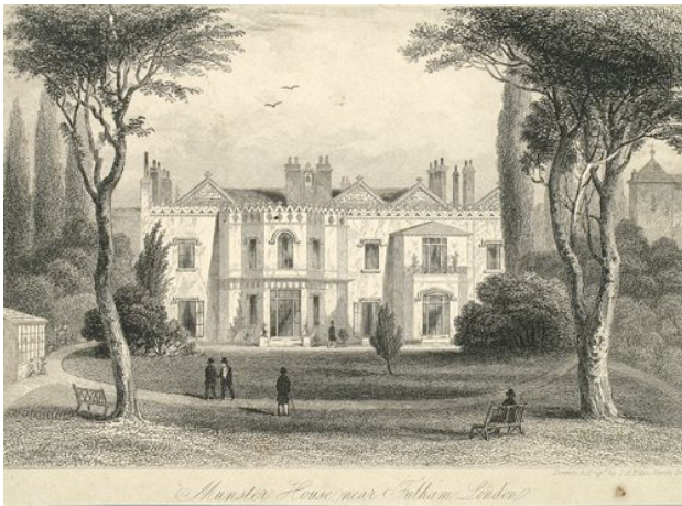
A 19th century view of Munster House, Fulham, showing it after the old mansion had been fashionably 'gothicked'.

Munster House, formerly known as Mustow or Muster House, stood at what is now the junction of Fulham and Munster Roads. Dating back to the late 16th or early 17th centuries, in 1705 it was described as a 'handsome, ancient house'. By 1814 it was much altered. The pseudo-gothic embellishments shown in the picture below were added in the mid 19th century.