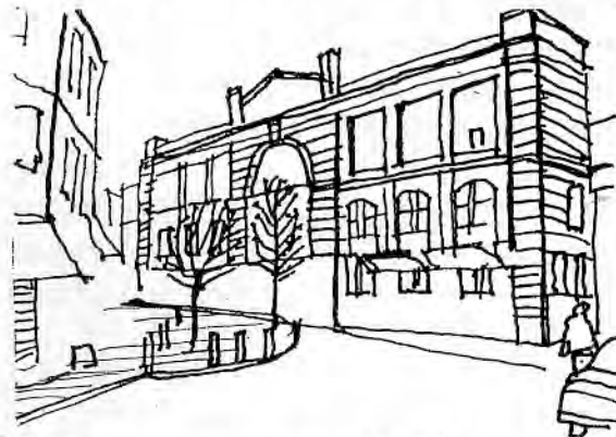
Putney Bridge Station

The Borough is about to review its Unitary Development Plan and consider changes. The Group has suggested a number of buildings we think should be added to the Local Register including The Old Ship Pub on the Mall, Albion Terrace, (the charming row of shops in Hammersmith Grove), former Kop's Brewery (now Fulham Wharf), Putney Bridge Station and the Pill box on the railway embankment.